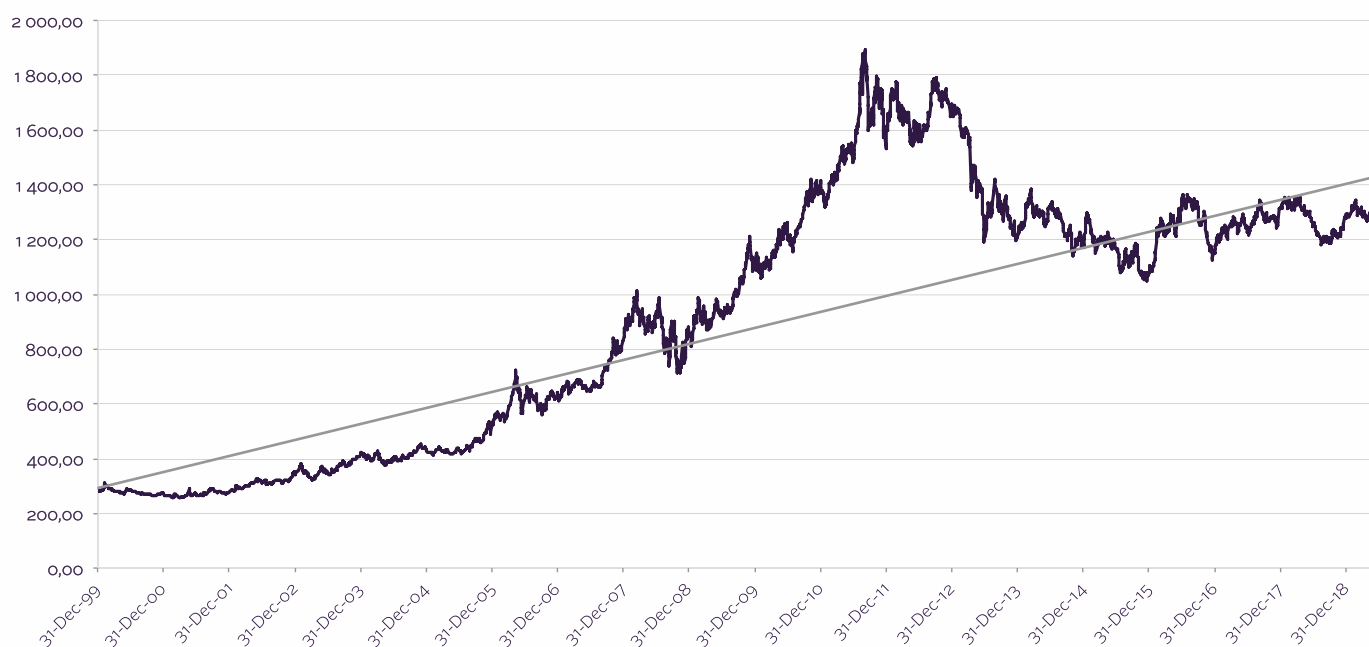
FIGURE 1: Chart of Gold Price in US Dollar from 31 December 1999 (LBMA PM Fix)